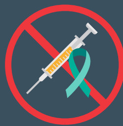
Cytotoxic Contaminated Sharps or IV bags