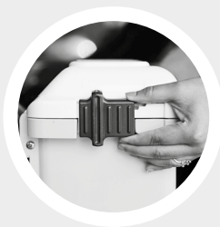
CANNOT BE REOPENED