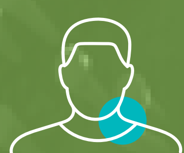
SWOLLEN LYMPH NODES