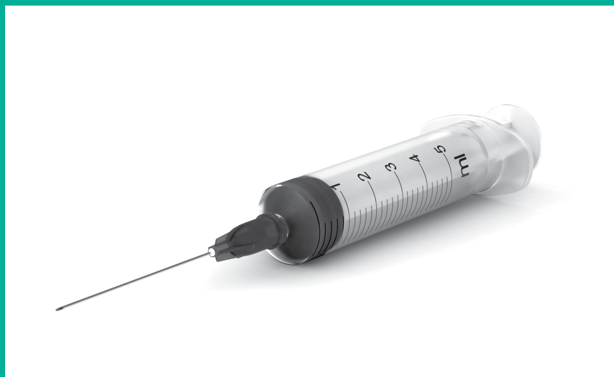
NEEDLES / SYRINGES

Sharps waste includes all used sharps capable of cutting or piercing the skin (except those contaminated with chemo)